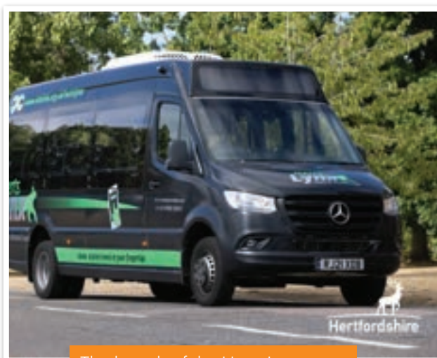
The launch of the Herts Lynx on demand bus service, in Dacorum, on 11 th December.