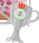
68 Miswell Lane