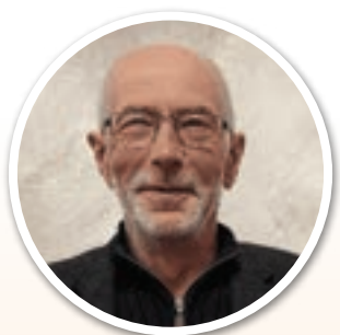
Cllr Nigel Nutkins Mayor

Chair: Allotments & Environment Committee